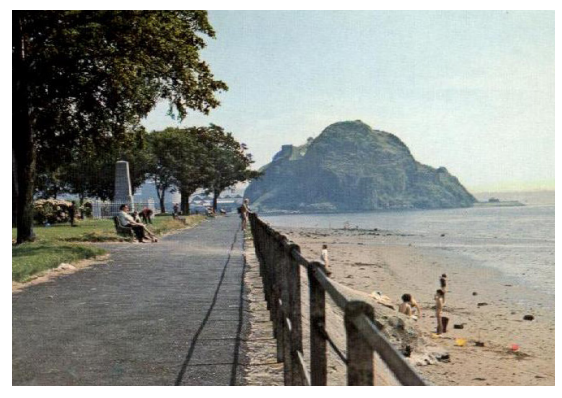
Dumbarton's Beach in the Past