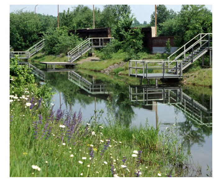
Develop the Waterfront Path