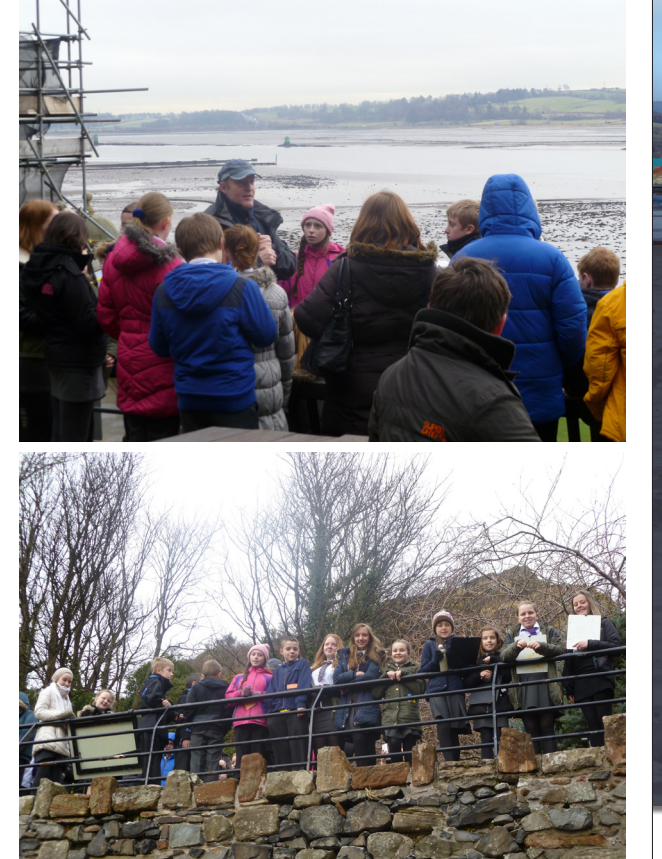
Primary School pupils were involved in Pre-Charrette Workshops.

A follow-up exhibition was held on 26 March.