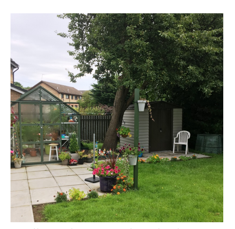
Mill Road new garden shed greenhouse and raised beds previous year