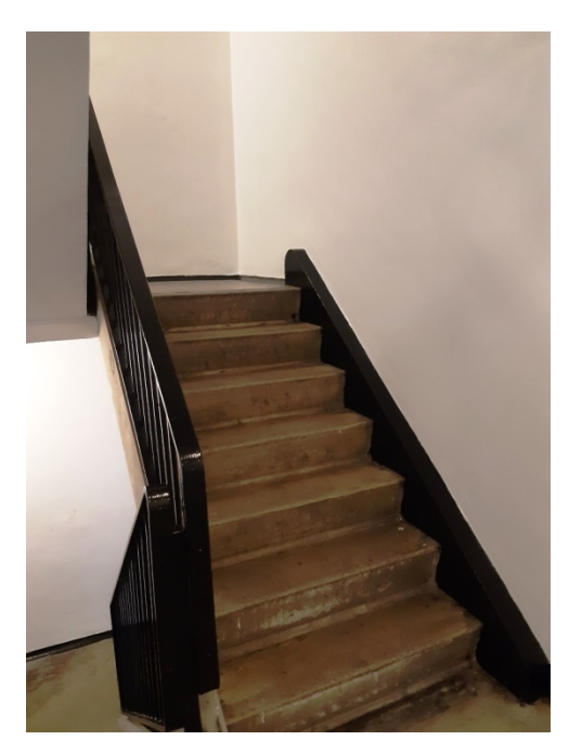
Kilbowie Court back stairs - walls and ceilings painted